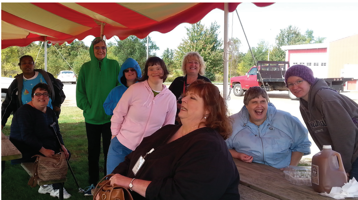
The Divine Divas, a support group facilitated by Disability Network in Berrien County enjoyed an outing at Grandpa's Cider Mill in Coloma.